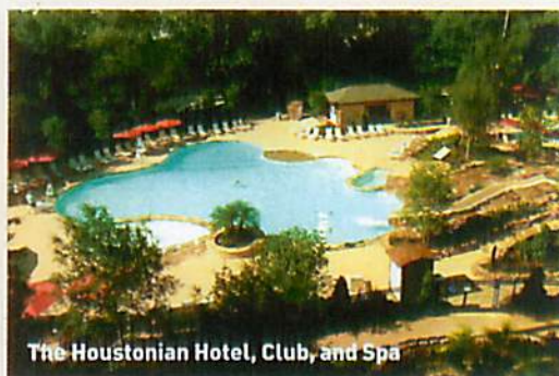
The Houstonian Hotel, Club, and Spa

Among the IHRSA stars cited were: the Bosse Sports and Health Club, in Sudbury, Massachusetts; The East Bank Club, in Chicago, the hometown favorite of President Obama's family; The Houstonian Hotel, Club, and Spa, in Houston (President George Bush belonged); the Sporting Club at the Bellevue, in Philadelphia; The Sports Club/LA, in Los Angeles; and the Zenergy Health Club and Spa, in Ketchum, Idaho. —